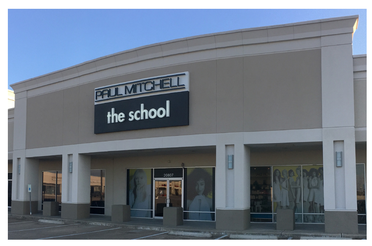
Paul Mitchell The School Houston, Webster Campus