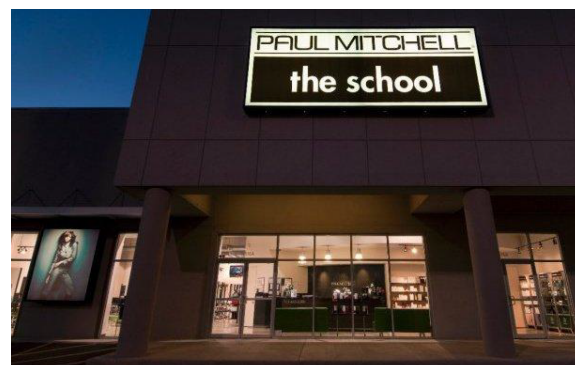
Paul Mitchell The School Houston, Houston Campus