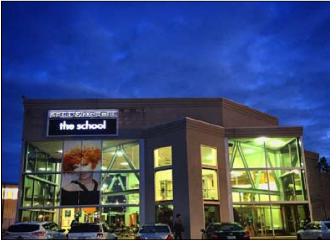
Paul Mitchell The School Columbus