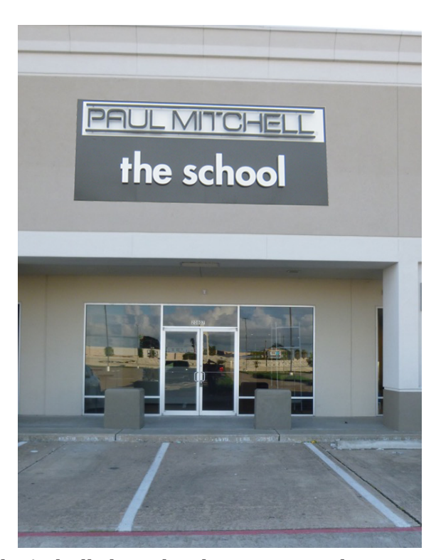
Paul Mitchell The School Houston, Webster Campus