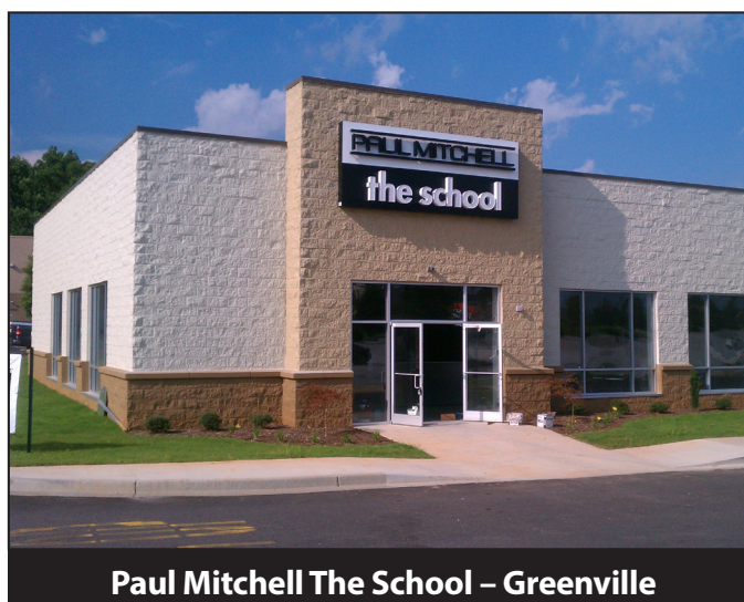
Paul Mitchell The School – Greenville