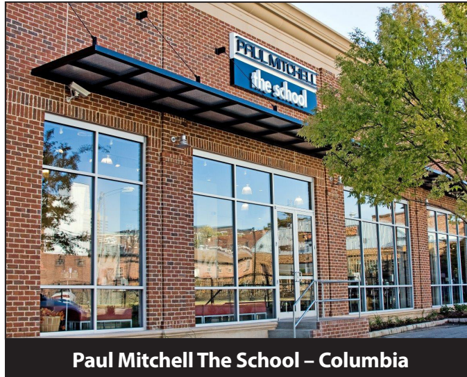
Paul Mitchell The School – Columbia