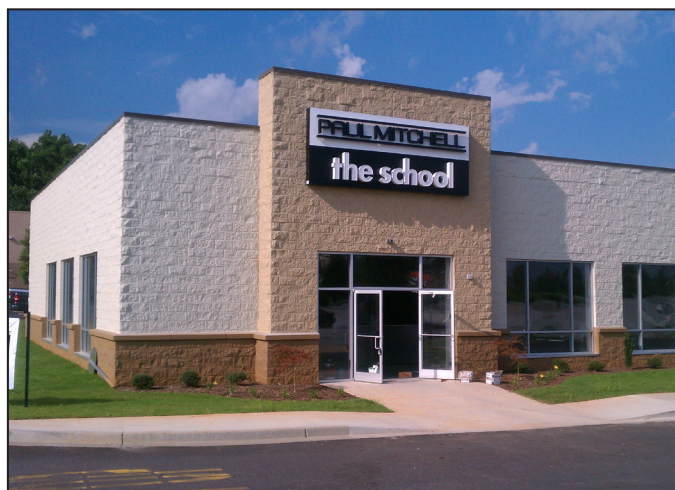
Paul Mitchell The School – Greenville