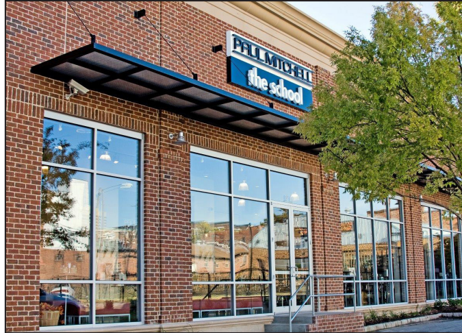
Paul Mitchell The School – Columbia