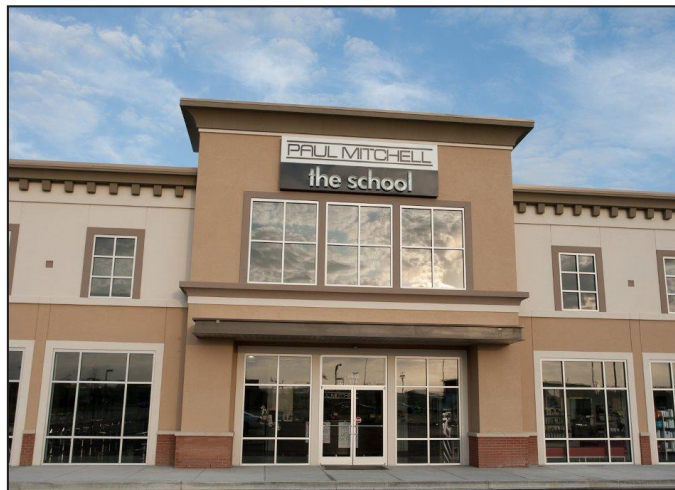
Paul Mitchell The School – Charleston