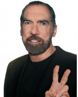
John Paul DeJoria

Chairman and CEO, John Paul Mitchell Systems