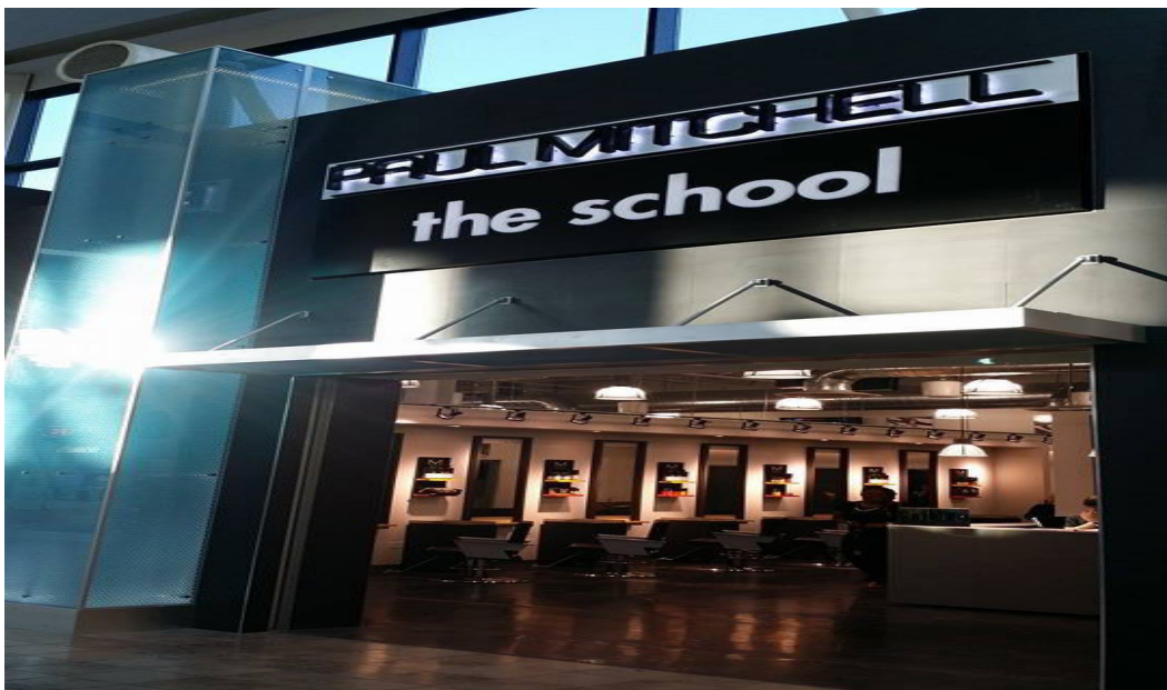
Paul Mitchell The School Tampa