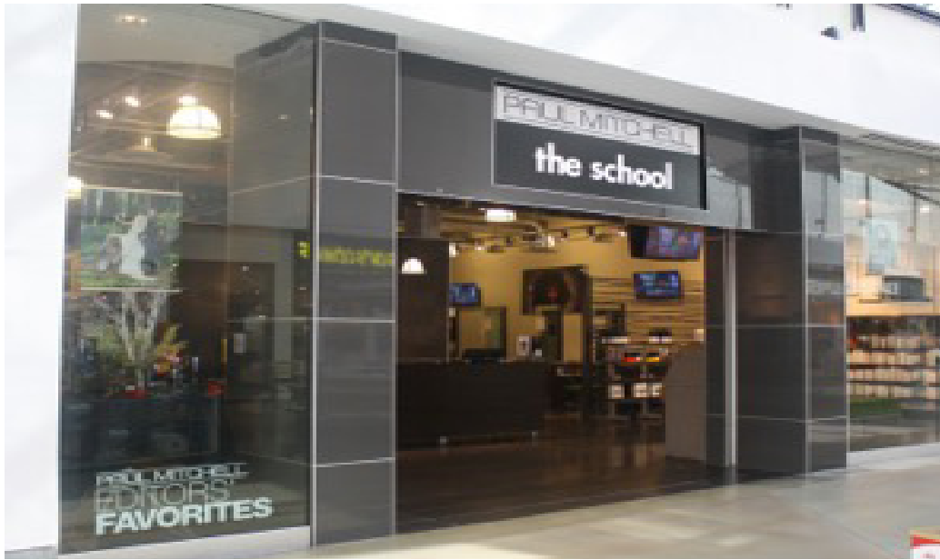
Paul Mitchell The School Orlando