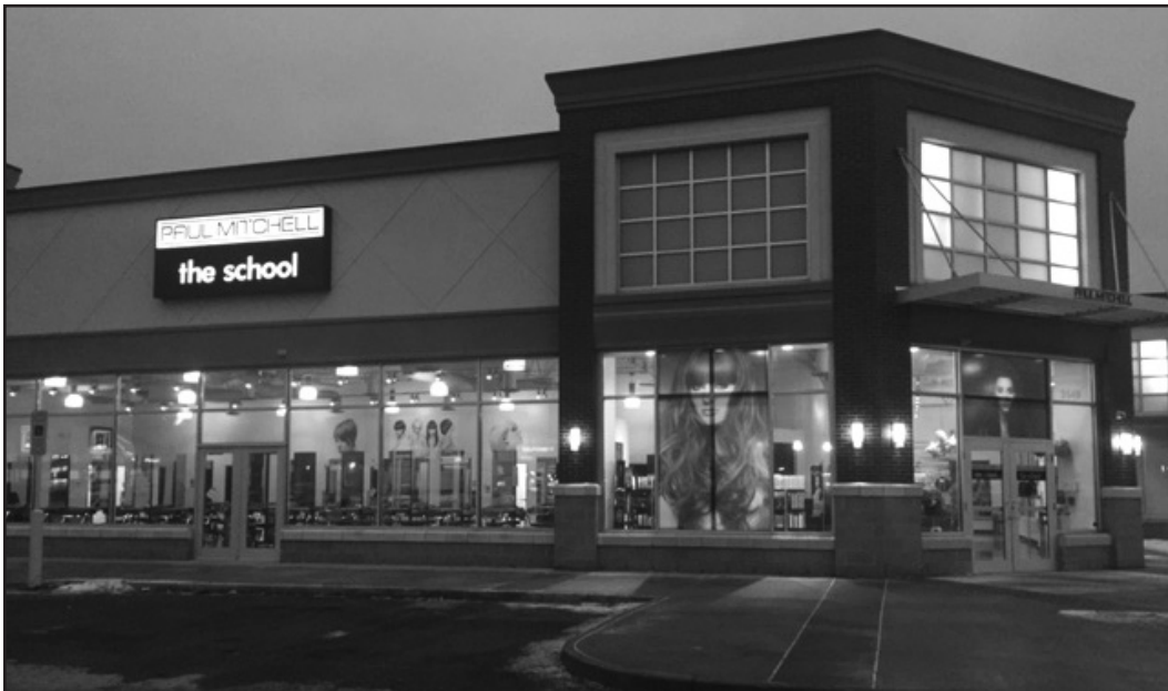
PAUL MITCHELL THE SCHOOL TOLEDO