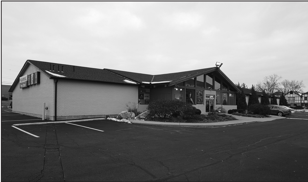
PAUL MITCHELL THE SCHOOL CINCINNATI