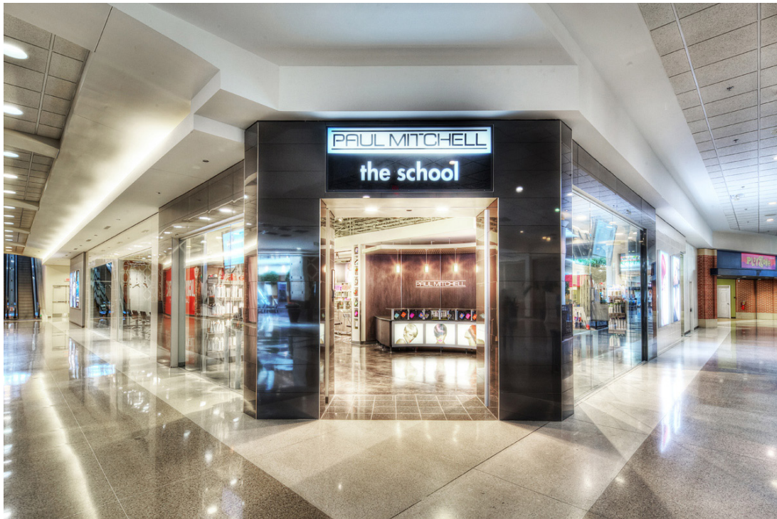
Paul Mitchell The School Lombard 106 Yorktown Center, Lombard, IL 60148