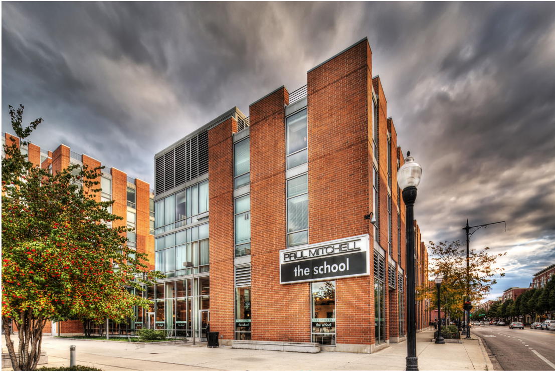
Paul Mitchell The School Chicago 1225 S. Halsted St., Chicago, IL 60607