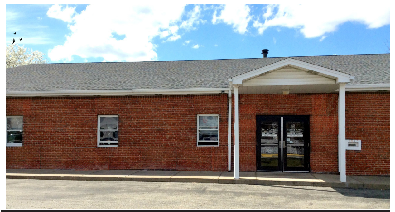
Bella Capelli Academy A Paul Mitchell Partner School: located in Monroeville